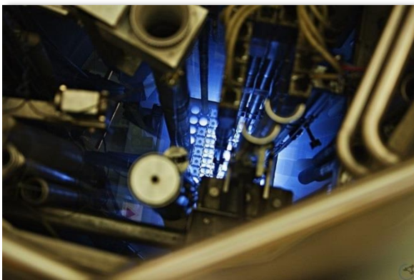
Research Centre Rez, RCR, Czech Republic