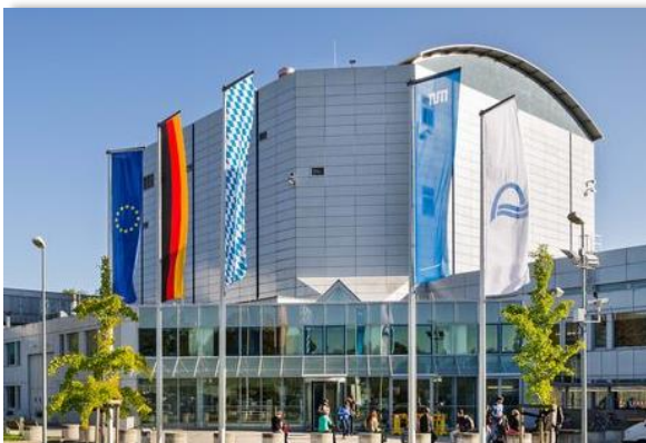
TUM, Forschungsneutronenquelle, Heinz Maier-Leibnitz (FRM II), Germany