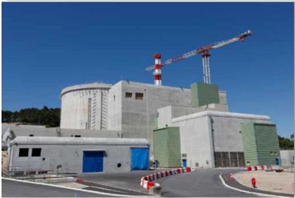
Jules Horowitz Research Reactor, JHR, Cardarache, France